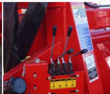
INDEPENDENT HYDRAULIC CONTROLS. SPEED CONTROL VALVE.