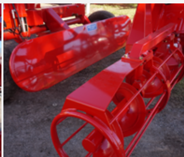
GRAIN PUSHER. IT ENSURES AN OPTIMIZED WAY OF ENDING THE BAG.