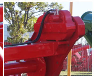
ROLLER TRANSMISSION ACHIEVED THROUGH A STURDY REDUCTION GEARBOX AND ONLY ONE CHAIN.