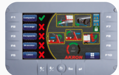
7" DIGITAL TRACTOR CAB DISPLAY (touchscreen)