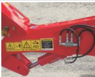
Height adjustment through hydraulic cylinder.

AKRON may change specifications and product designs in this or other brochure at any time, without previous notice. Pictures shown are for illustration purposes only.