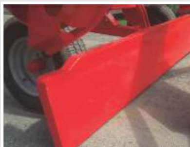
Grain Pusher. It ensures a better end of bag.