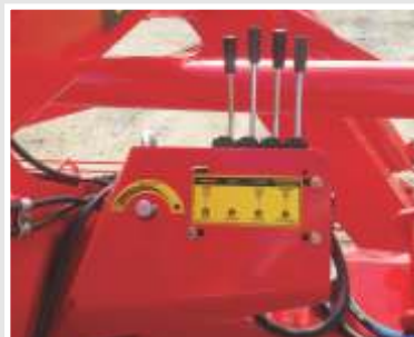
Independent hydraulic controls. Speed Control Valve.