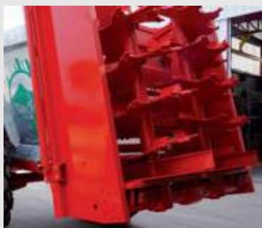
Two vertical beaters.

AKRON may change specifications and product designs in this or other brochure at any time, without previous notice. Pictures shown are for illustration purposes only.