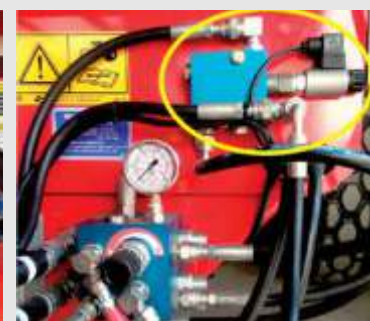
Built-in hydraulic commands.